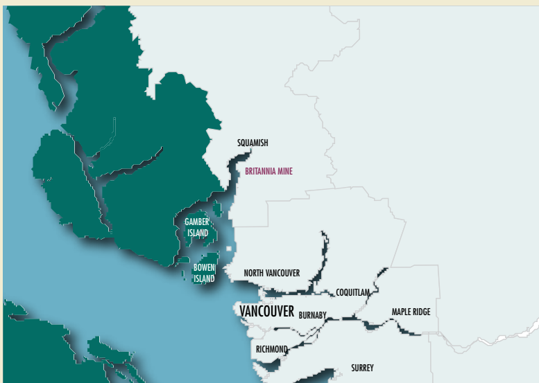
Exhibit 1: Location of the former Britannia Mine, north of Vancouver

Source: Office of the Auditor General of British Columbia