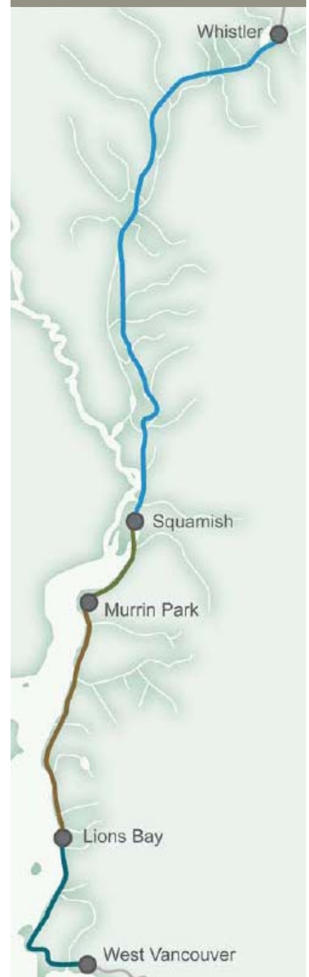
Exhibit 1: Route of the Sea-to-Sky Highway