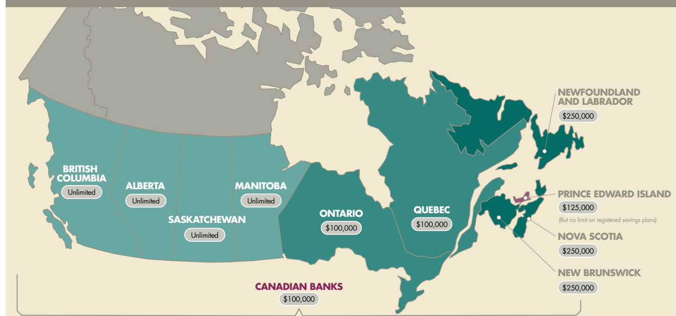
Exhibit 2: Deposit insurance limits for credit unions in Canada

Note: Where limits exist, they are usually account-specific. Investors therefore often have the option of arranging their affairs to have more than one insured account. This is a summary only. For complete details, check with the appropriate deposit insurer.